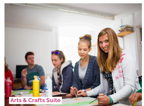
Arts & Crafts Suite