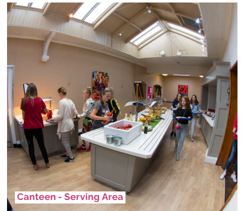
Canteen - Serving Area